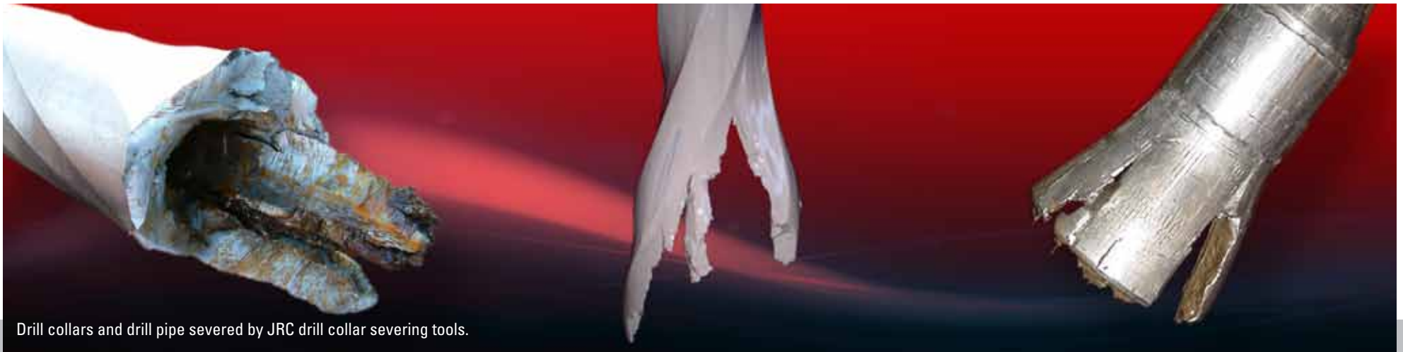
Drill collars and drill pipe severed by JRC drill collar severing tools.